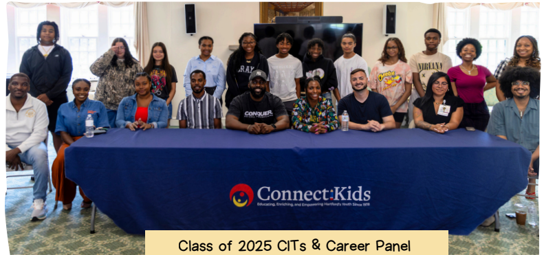
Class of 2025 CITs & Career Panel

Step into leadership this summer as a Counselor-in-Training (CIT)! Mornings are focused on engaging professional development, and afternoons put you in real leadership roles, co-leading classes with younger campers alongside a lead staff member. Additionally, CITs will tour local colleges, join camper adventures, and explore new places and opportunities!