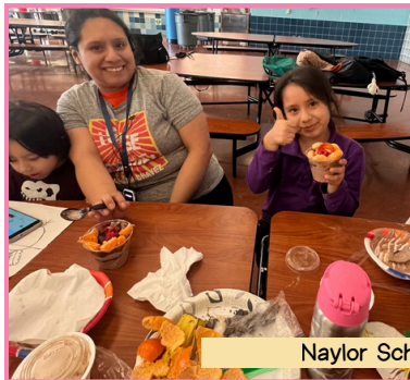
Naylor School – April 8 th