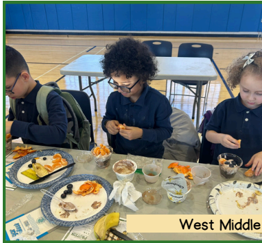
West Middle School – March 18th