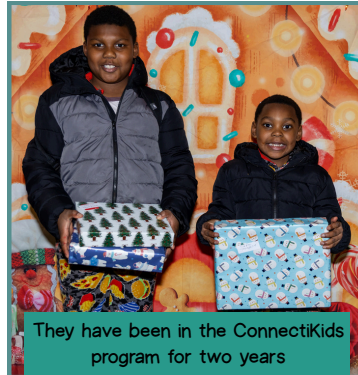
They have been in the ConnectiKids program for two years