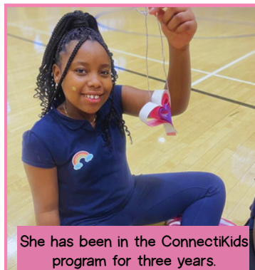
She has been in the ConnectiKids program for three years.