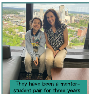
They have been a mentor-student pair for three years

These single snapshots of ConnectiKids students are moments of joy, learning, and growth. These photos capture exactly who our Annual campaign is for. Each child represents a story in motion, and your support plays a meaningful role in shaping the next chapter.