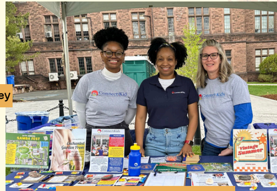
Trinity College Samba Fest