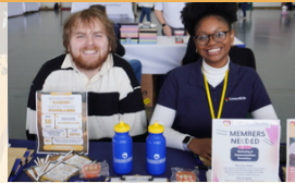
Summer Activities Resource Fair