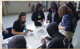
STEM Day at Pratt & Whitney

We are grateful for the support and collaboration of our valued partners at Pratt & Whitney, Trinity College, and the City of Hartford. Our aim is to maintain a strong presence within the community and we cherish the opportunities to venture out and engage directly with prospective partners, families, and students, fostering meaningful connections and exchanges.